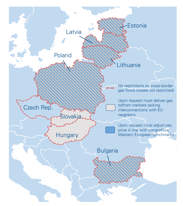
Figure 3: Overview of the Gazprom Settlement<sup>6</sup>

The Commission has been concerned that Gazprom has used its dominant position in the gas supply market to obtain undue advantages with regard to access or control of infrastructure. These concerns applied particularly in two cases: the South Stream project in Bulgaria and the Yamal (EuRoPol) Pipeline in Poland. As regards South Stream, Gazprom will not seek damages as a result of the cancellation of the project, regardless of whether any benefits have been obtained. As regards the Yamal pipeline, the European Commission has found that the operator, EuRoPolgaz (co-owned by Gazprom) has not been able to block or delay any investments requested by the TSO, Gaz-System. Although no guilt has been proven, Gazprom will commit to refraining from influencing decisions regarding infrastructure to its advantage in the future.