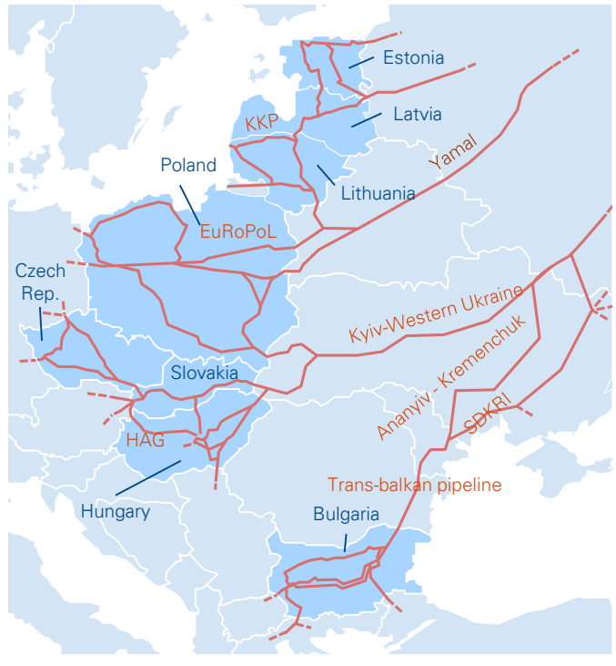
Figure 1: The eight affected member states and their pipeline connections with Russia

In September 2012, the European Commission opened formal proceedings against Gazprom for possible abuse of a dominant position in several gas supply markets in Central and Eastern Europe. In 2015, the allegations were more precisely formulated in a Statement of Objections, claiming that Gazprom was pursuing a strategy to divide gas markets, in breach of EU anti-trust rules, that prevented competition in the markets of Bulgaria, the Czech Republic, Estonia, Hungary, Latvia, Lithuania, Poland and Slovakia. The claim was based on three issues: (1) territorial restrictions on the resale of gas (2) unfair pricing policies, and (3) use of a dominant position to obtain unrelated commitments concerning transport infrastructure.