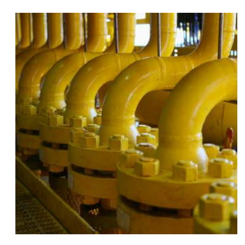
The proposed Gas Directive amendment and the EC-Gazprom settlement

Could the proposed Gas Directive amendment compromise the progress made in the Gazprom dispute settlement?