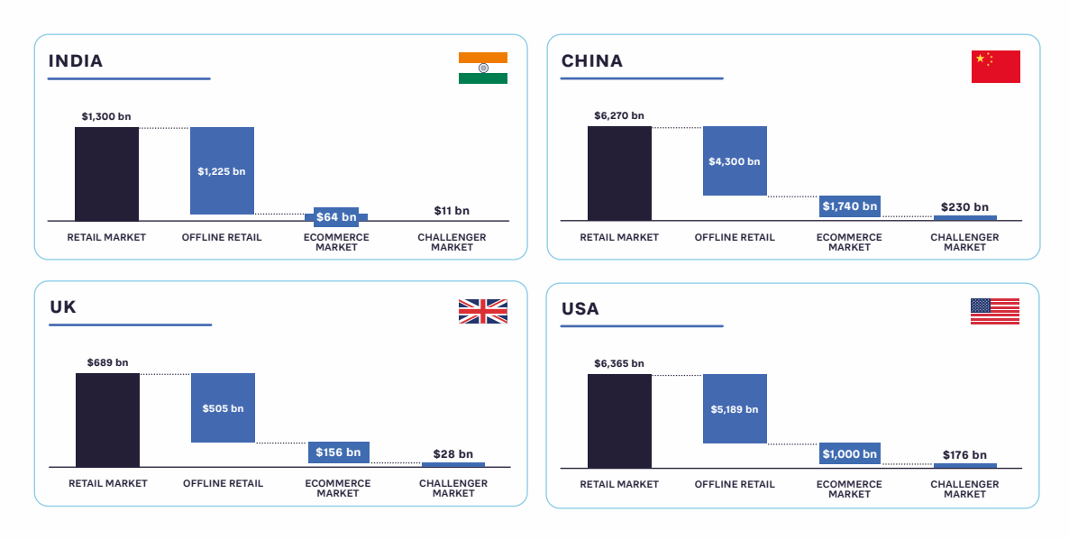
FIGURE 1: MARKET OPPORTUNITY FOR CHALLENGER BRANDS IN INDIA, THE US, CHINA, AND THE UK

Figure 1 shows the market size of retail (USD bn), the online market, and the current opportunity captured by challenger brands. This highlights the size of the opportunity for challenger brands to grow and capture in retail.