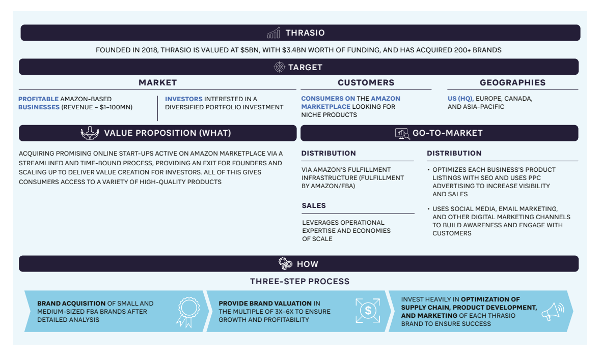
FIGURE 3: CASE STUDY ON THRASIO - US-BASED START-UP THAT ACQUIRES AND SCALES CHALLENGER BRANDS

This approach minimizes overheads (such as customer service costs), creates supply-side synergies, and achieves scale through a single company offering a range of distinct brands targeting different consumer segments. Essentially, it is the digital equivalent of an FMCG brand company such as P&G or Unilever, with leaders including Thrasio in the US and India's Mensa Brands, which achieved unicorn status in under a year. Success requires careful management and coordination to maintain each brand's unique identity and positioning while achieving synergies. Figure 3 provides more details on Thrasio's approach.