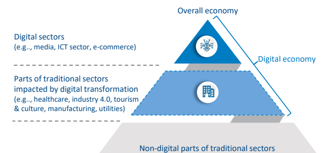
Figure 1: What is the digital economy?

and economy, make it difficult to agree on a definition for "digital economy". For the purposes of this report, we will define it as "the economic and social output derived from the use of digital technologies across sectors". The digital economy encompasses purely digital sectors, such as media, ICT and e-commerce, as well as parts of traditional sectors impacted by digitalization (e.g., Industry 4.0) (see Figure 1). KSA has demonstrated full commitment to the development of the digital economy; it is one of the Kingdom's key objectives to unlock the potential of non-oil sectors and ultimately help grow and diversify the Saudi economy. Although the digital economy is estimated to have contributed 17.7 percent to KSA's GDP in 2020 (SAR 449 bn), it is expected to grow ~SAR 137 bn and reach 19.4 percent by 2025 (SAR 586 bn)<sup>1</sup> (see Figure 2). This presents Saudi companies with an opportunity to unlock revenues exceeding SAR 200 bn. Such a chance to strengthen the Kingdom's position as a regional and global economic leader cannot be missed.