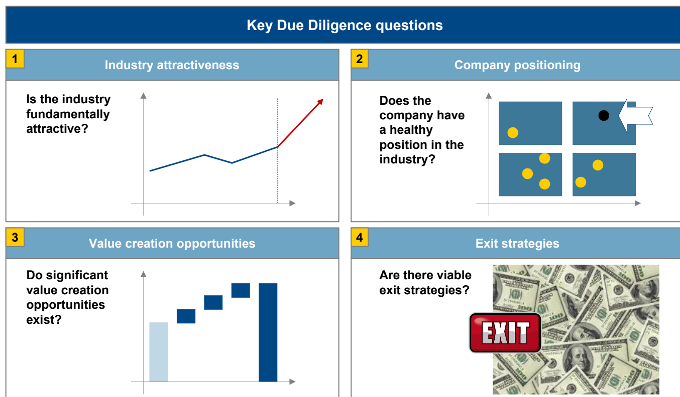
Exhibit 2: Key due diligence questions

Firms that are currently utilizing outside board representation most typically access these individuals through informal networks and industry contacts. Sometimes these outside resources can be of great value in mediating conflict between management and ownership. Private equity firms who are successful in using this organizational model draw heavily on the outside board members to frame corporate governance structure.